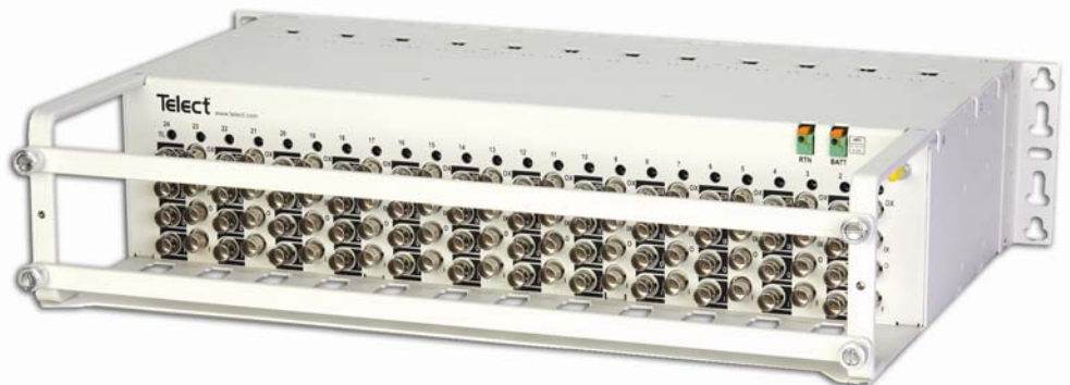
Rear view, 24-termination 6-port panel, part #010-8324-0410