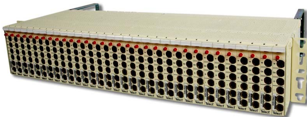
Front view, 32-termination 6-port panel, part #010-8332-0410